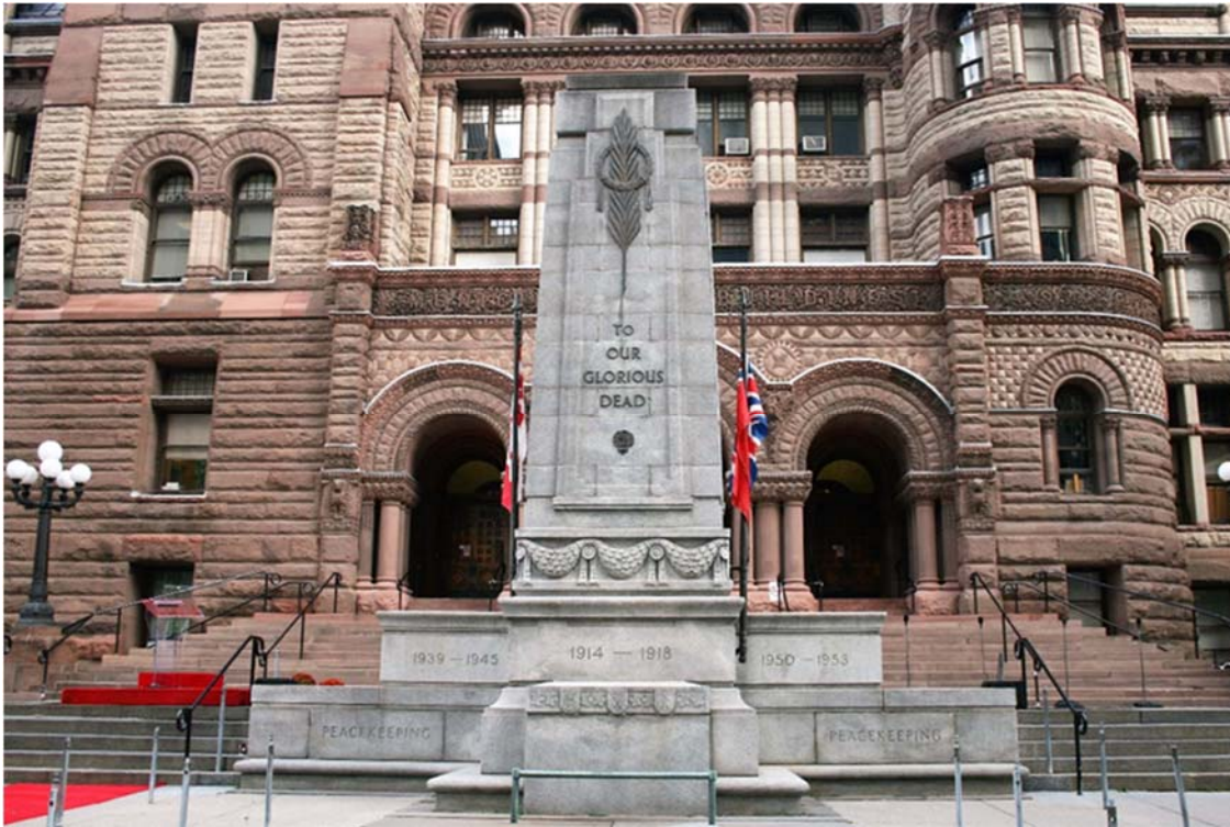
Cenotaph at Old City Hall, Toronto, Ontario