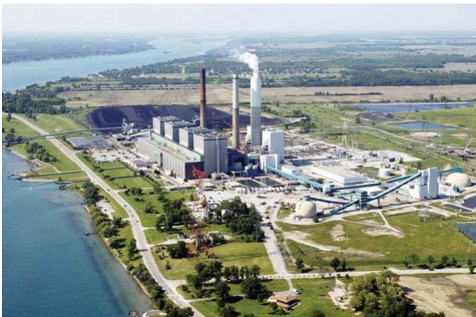
Photo: Lambton Generating Station

November 22, 2016. Ontario Power Generation (OPG) has announced a plan to decommission the Lambton Generating Station near Sarnia, Ontario. The Power Workers' Union disagrees with this plan and has submitted to the Minister of Energy that the existing Lambton and Nanticoke Generating Stations are of much greater value to the province as a repurposed, low-cost, dispatchable source of the province's peak electricity supply. Converting the retired coal generating stations to utilize carbon-neutral biomass in conjunction with natural gas, is a low-cost option that would deliver significant environmental and economic benefits to the province.