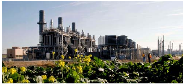
Greenfield Energy Centre

In November, 2016, the Power Workers' Union (PWU) was certified by the Ontario Labour Relations Board as the bargaining agent for the employees of EthosEnergy (Canada) Ltd., working at the Greenfield Energy Centre in the Town of Courtright, near Sarnia, Ontario.