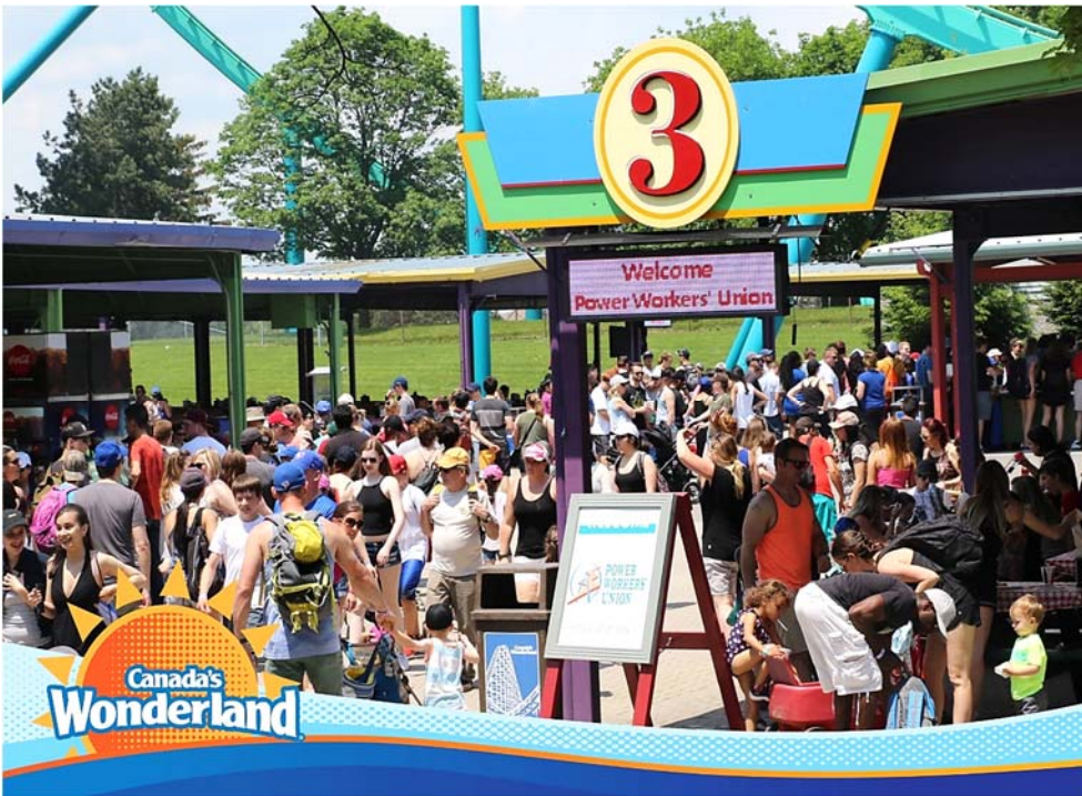
PWU members enjoying the Courtyard Area at Canada's Wonderland

The first ever PWU Day at Canada's Wonderland took place on June 10, 2017 with over 4,500 PWU members and their families partaking in an incredible day amongst family and friends.