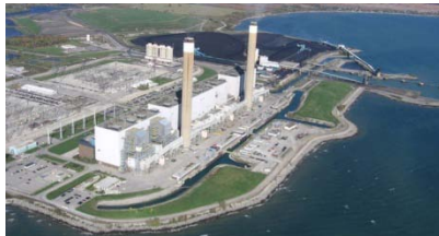
Nanticoke Generating Station

The PWU has a proud history at both stations. The Union has had membership units at Lambton since 1969 and Nanticoke since 1973 ranging up to 800 members in total.