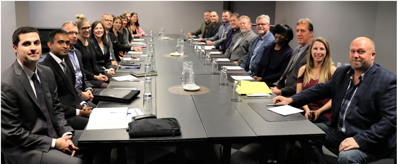
(Left) Members of the Toronto Hydro Bargaining Committee, meet with the members of the PWU-Toronto Hydro Bargaining Committee (Right).

Bargaining towards a new collective agreement between the PWU and Toronto Hydro began on October 17, 2017. The parties met regularly since the commencement of bargaining until December 1, 2017 and then again during the week of January 15, 2018.