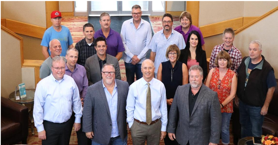
2017 Bargaining Committee Members from Power Workers' Union and Bruce Power.

The negotiations for the 2017 PWU-Bruce Power Collective Agreement began on October 3, 2017. The parties have met regularly since the commencement of bargaining until December 21 and then again,