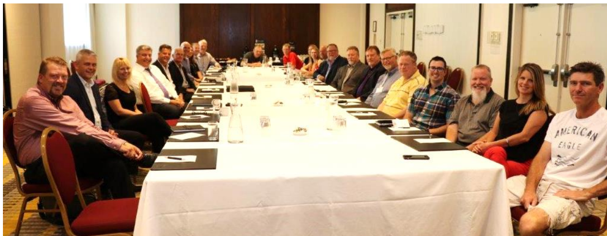
(left) Representatives of the Alectra Bargaining Committee and (right) PWU-Alectra Bargaining Committee.

the week of January 8, 2018. To date, the parties have been unable to reach an agreement, and the Union has requested that the Ministry of Labour appoint a Conciliation Officer to assist in finalizing an agreement in a timely fashion.