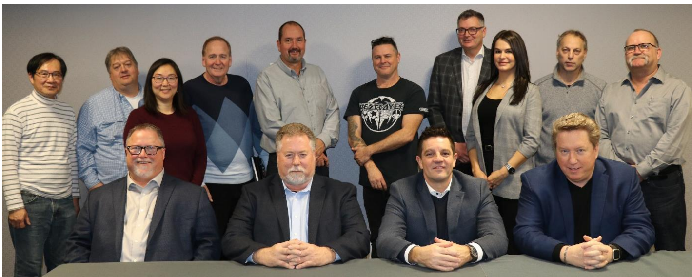
Members of the PWU-OPG Collective Bargaining Committee are set to begin negotiations.