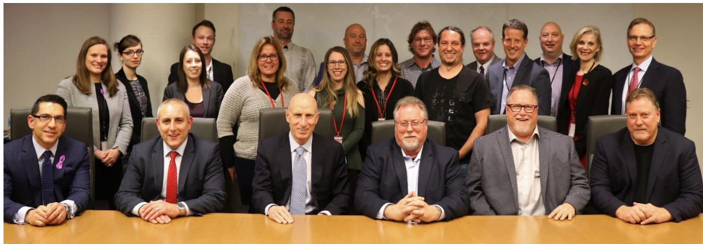
Members of the PWU and Hydro One Bargaining Committees pose for a commemorative photo as 2018 collective bargaining begins.

The Power Workers' Union (PWU) is now engaged in collective bargaining negotiations with many of its employers. On January 15, 2018, the bargaining committees from the PWU and Hydro One met for the