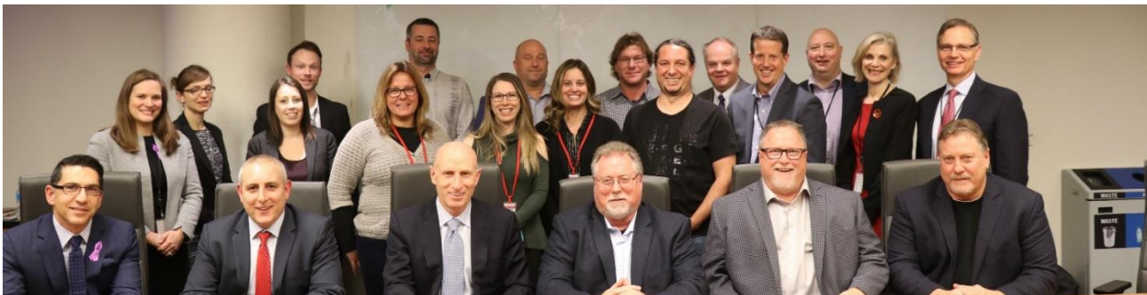
Members of the PWU and Hydro One bargaining committees have reached a Memorandum of Agreement. Member ratification meetings are scheduled between April 30 and June 13, 2018.

I am pleased to announce that a Memorandum of Agreement (MOA) has been reached between The Power Workers' Union and Hydro One on April 23, 2018. The Chief Stewards within Hydro One have voted unanimously to support the bargaining committee's endorsement, recommending the membership accept the MOA. I encourage members to attend the ratification meetings that will be occurring between April 30, and June 13, 2018. Contract referendum ballots will be counted at the union office on June 27, 2018. Your bargaining teams and support staff remain focused on resolving the other four collective agreement negotiations currently underway.